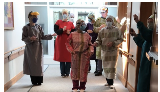
Hospice staff and volunteers, dressed in full PPE, celebrated Nurses Week and Florence Nightingale's 200th birthday by dancing down the halls.