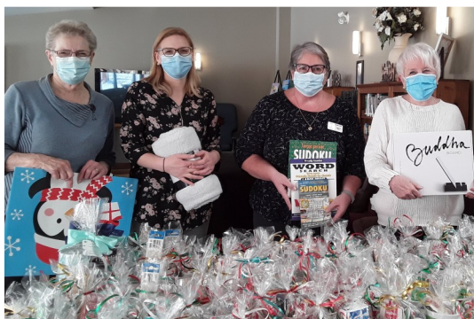
Volunteers and staff filled and delivered 85 community comfort kits to our clients living in the community.