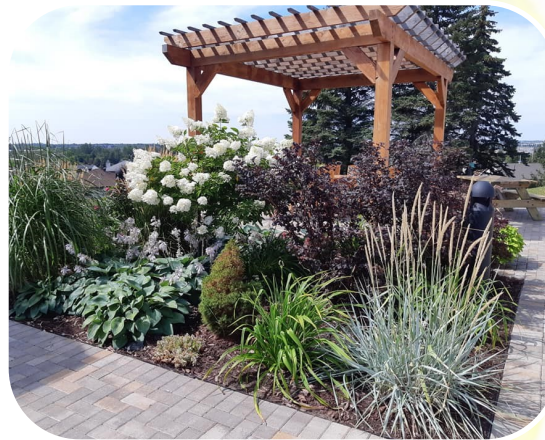
Hospice residences have remained open to provide end-of-life care. Volunteers lovingly maintain our gardens so visitors can have a beautiful space to spend time with their loved ones.